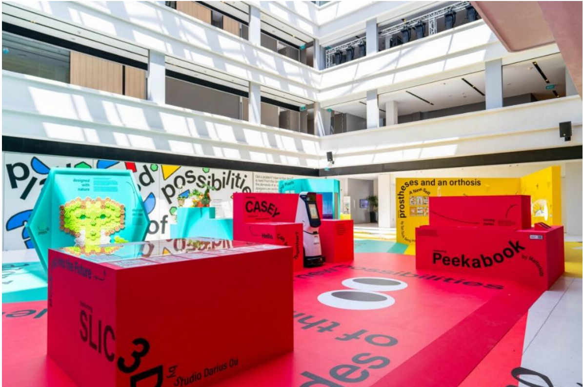
Playground of Possibilities at National Design Centre.

This showcase spotlights 12 design “stories of possibilities” from Singapore that tackle some of the most pressing challenges we face today with innovative solutions. The collection of playful and interactive installations, showcase four design principles or ‘pals of possibilities’ – Explore, Empathise, Imagine and Adapt – that designers use to tackle problems, transform them into opportunities, and dream up new possibilities.