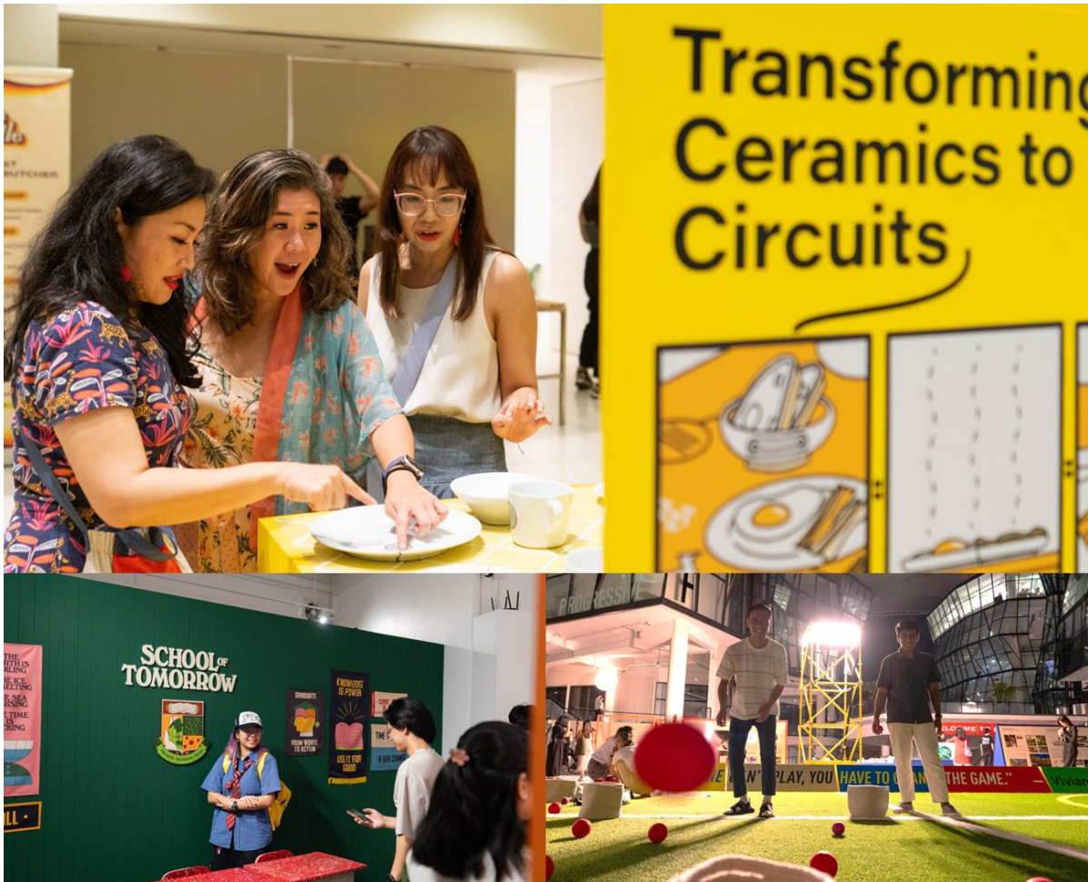
Festival-goers at the inaugural Singapore Design Week Friday Late, a self-guided tour around the Bras Basah.Bugis District.