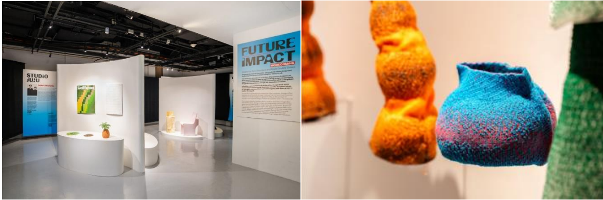
Future Impact: Homecoming Showcase at National Design Centre.